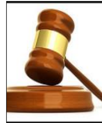
Honorable Brad King Treatment Court Judge